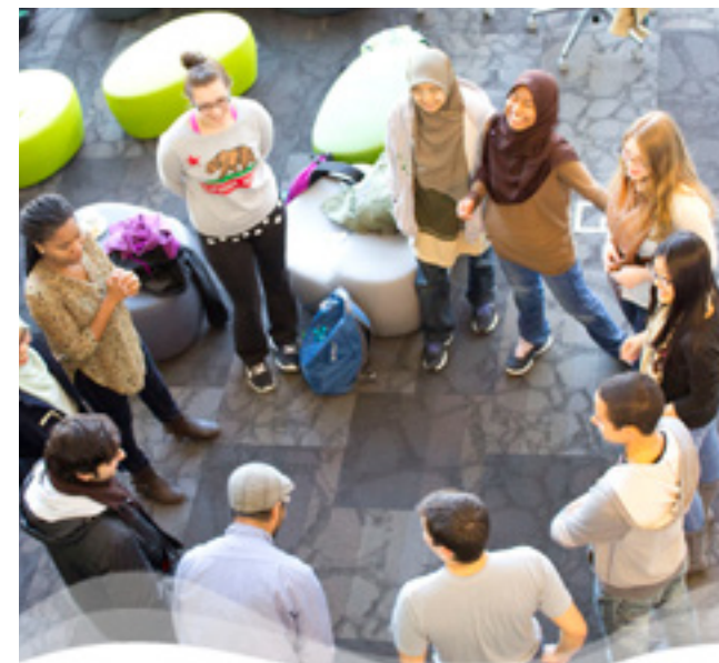
Students play a game using their Arabic listening skills

This spring semester, the ELC has again partnered with MSU's Center for Language Teaching Advancement (CeLTA) to provide fun and interactive language and culture exchange opportunities for both international and domestic students. In February, the ELC and CeLTA launched the Arabic-English Language and Culture Exchange, a group where Arabic-speaking English language learners and English-speaking Arabic language learners come together to share their cultures and practice their second languages. At each of the meetings, thirty students gathered to meet one another, mingle, play language games, and find a conversation partner. Activities included language games from vocabulary races to identifying animal sounds. They also learned about cultural activities like traditional dances and marriage traditions. As this language exchange and the Portuguese-English language exchange (which started in Fall of 2013) have been so successful, the ELC and CeLTA are working to create similar groups for Korean, Japanese, and Chinese in the Fall 2014 semester.