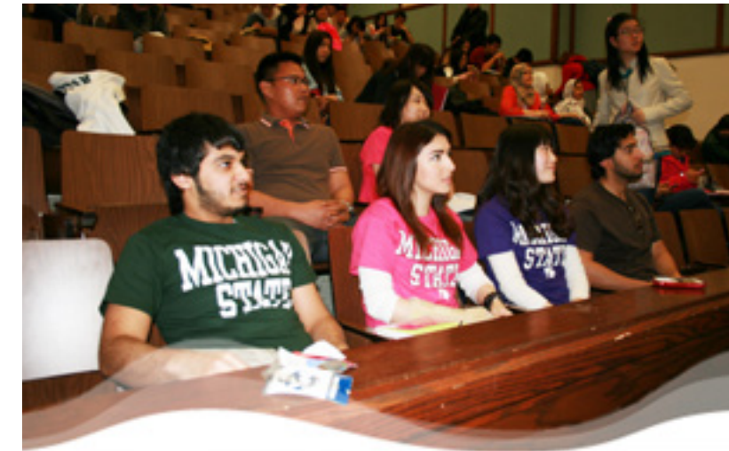
093 Students listen to a lecture in Olds Hall

When we first began developing the course, we were looking for something different to offer our students. We realized that while most of our ELC classes are small and communicative (great for language acquisition) when students leave us, they experience a range of classroom styles, including large lectures. We felt it was important that our students also have experience with the lecture format where the contact with the professor is much more limited and the expectations are much different.