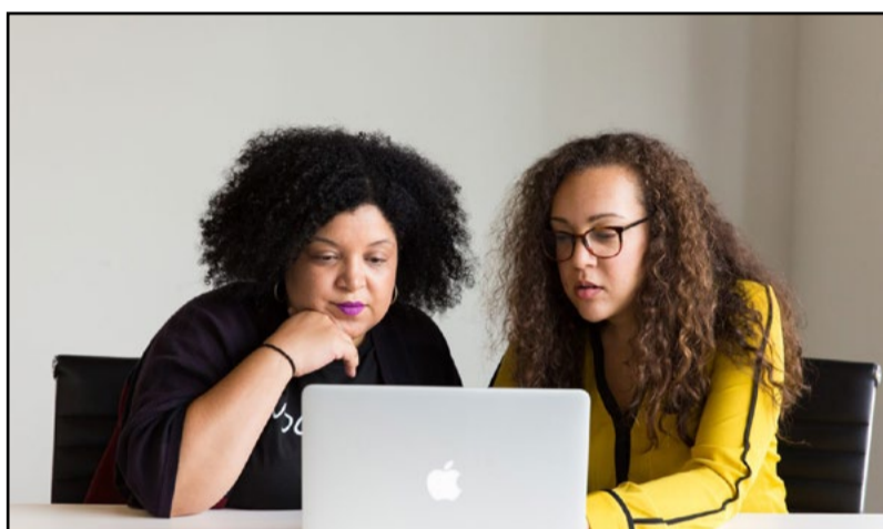
Image: Two women sitting at a desk are working on a laptop

The English Language Center is pleased to offer two new online courses for Spring Semester 2021: AAE 291 and AAE 491.